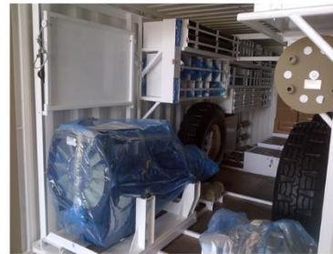
Inside left view with fold down work bench above the Engine assembly in the stowed position and various spare parts and bins.