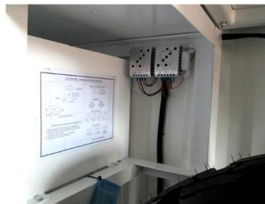
Two solar charging display panels for the two batteries and the container light switch to the right of the control panels.